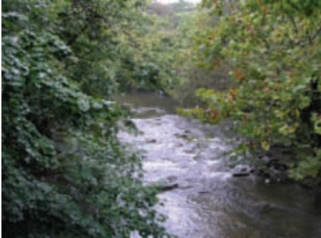
Increase riffles, runs, and pools in TROUT CREEK, located in Heidelberg Township, Washington Township, and the Borough of Slatington.