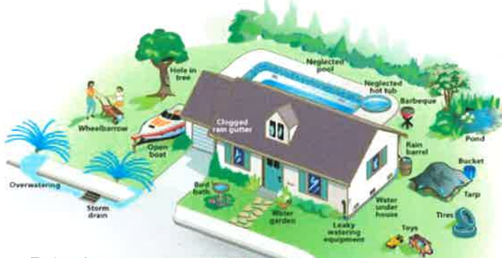
Potential mosquito habitats in and around your home

Can't dump it? Treat it with an insecticide that specifically targets mosquito larvae such as Bti - ( Bacillus thuringiensis subspecies israelensis ).